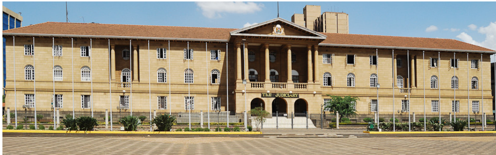
The High Court buildings

The constitution that was promulgated in 2010 requires judges and magistrates to be vetted to establish their suitability to continue serving in the Judiciary.