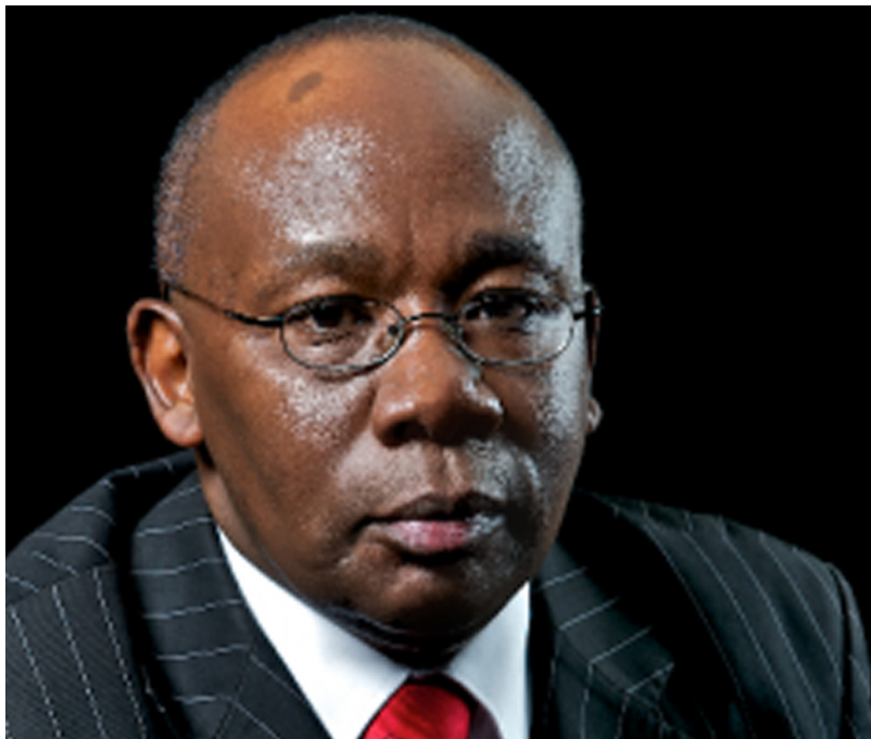
Attorney General Githu Muigai

According to Attorney General Githu Muigai, it will take two years to get the court up and running. 28