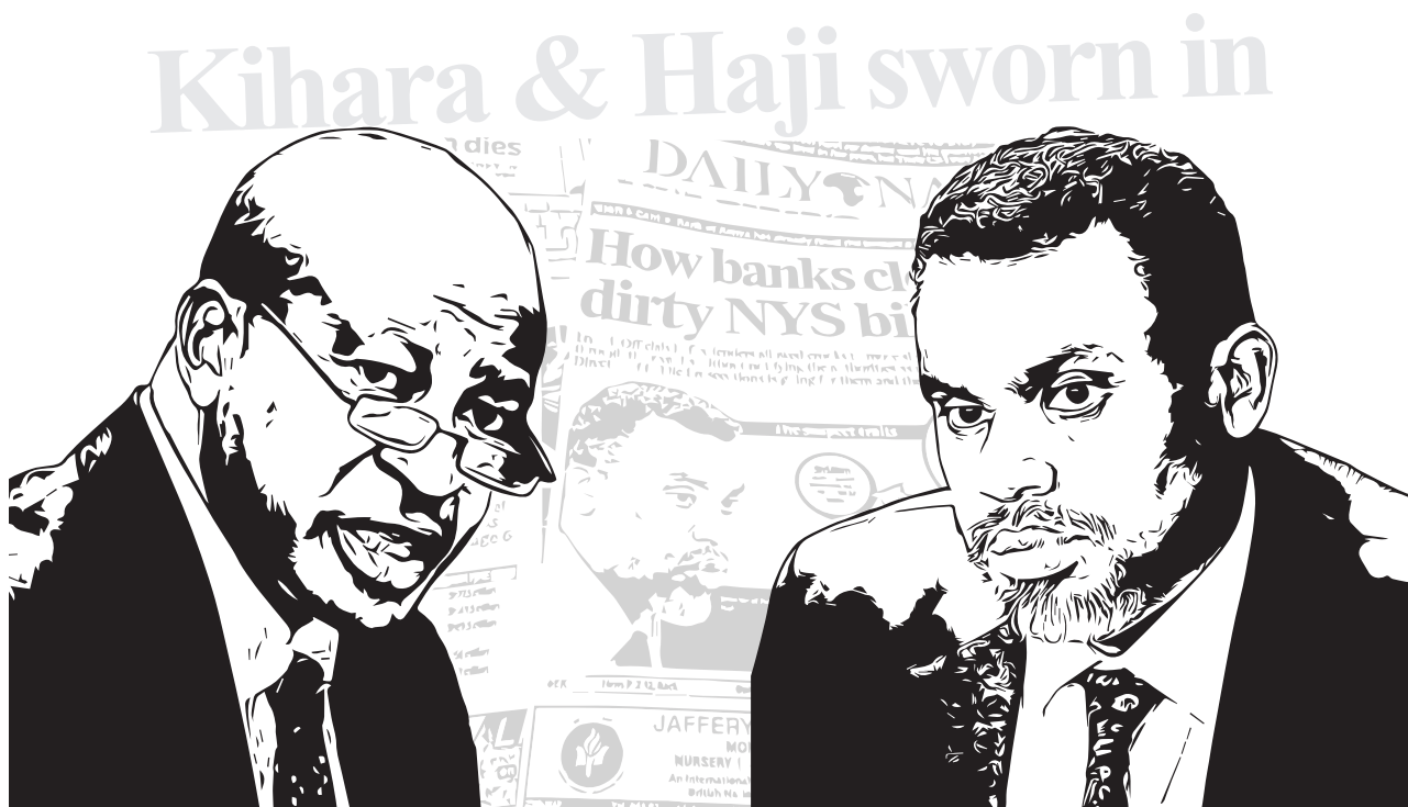
Paul Kihara , Attorney General

It has been a frantic period since 13 March 2018, when President Kenyatta appointed Noordin Haji of the National Intelligence Service (NIS), as the Director of Public Prosecutions (DPP), to replace the lacklustre Keriako Tobiko, who is now Cabinet Secretary for Environment and Forestry. Almost simultaneously, Mr Kenyatta also appointed Paul Kihara, former President of the Court of Appeal as the Attorney General (AG) to replace Githu Muigai, completing what was seen as both a makeover and a clean-up of the ineffectual State Law Office 1 . On the political front, Uhuru Kenyatta's reconciliation with his main rival, Raila Odinga of the National Super Alliance (NASA), restored some measure of the political legitimacy that he lost in the deeply flawed presidential elections of 2017. Because the appointments and the making-up were so unexpected, so seemingly out of character, and so removed from the usual hands-off, see-no-evil, hear-no-evil modus operandi of Mr Kenyatta's first term, many observers were convinced that the President had made a break with the past; that he was primed to battle the twin bugbears of his administration: the toxic post-election politics – which were both polarising and debilitating – and institutionalised corruption.