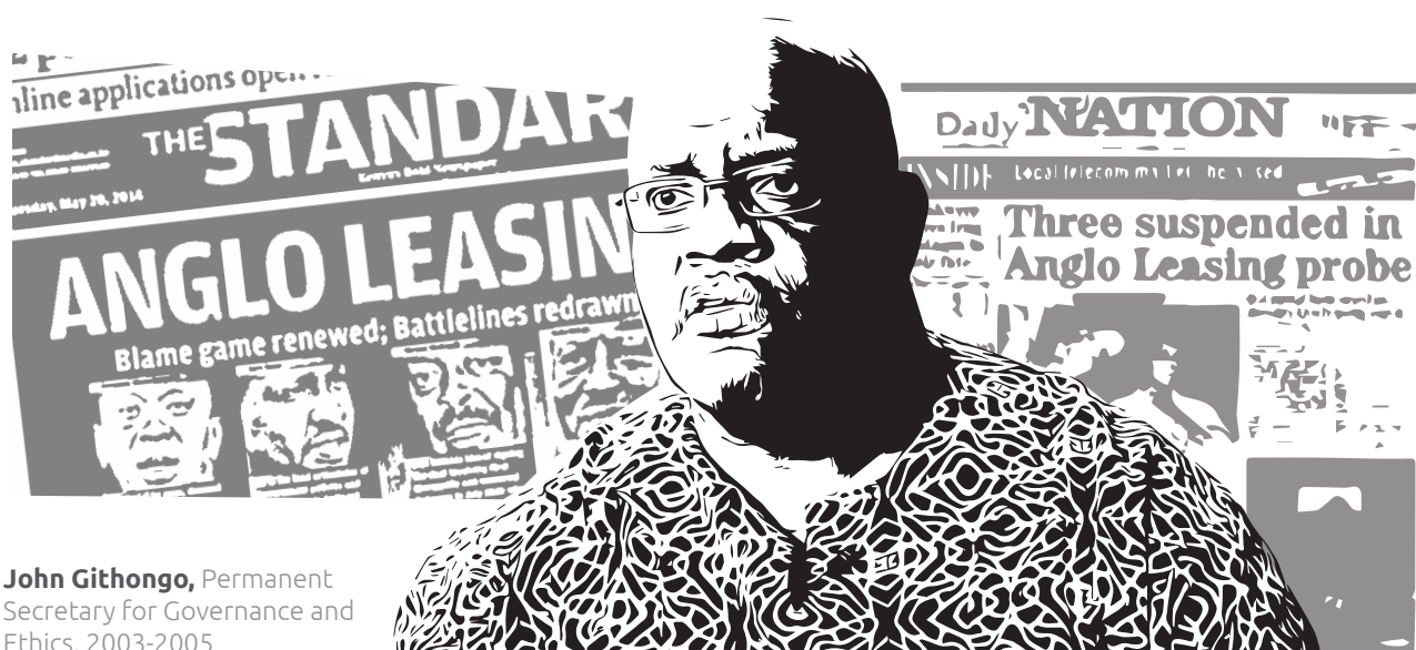
John Githongo , Permanent Secretary for Governance and Ethics, 2003-2005

One issue surrounding the scandal is what President Kibaki knew and when he knew it. For instance, on the forensic labs contract, the secretary to the Cabinet had indicated to Githongo that he had briefed the President on this contract, but when Githongo met the President on 29 May, 2004 Kibaki said that no one had briefed him and asked to be furnished with a copy of the contract. Two days later, Muthaura would insist that the President had been fully briefed and that it had been agreed (i) all payments were to be stopped and (ii) that the authorities must establish who Anglo Leasing was.